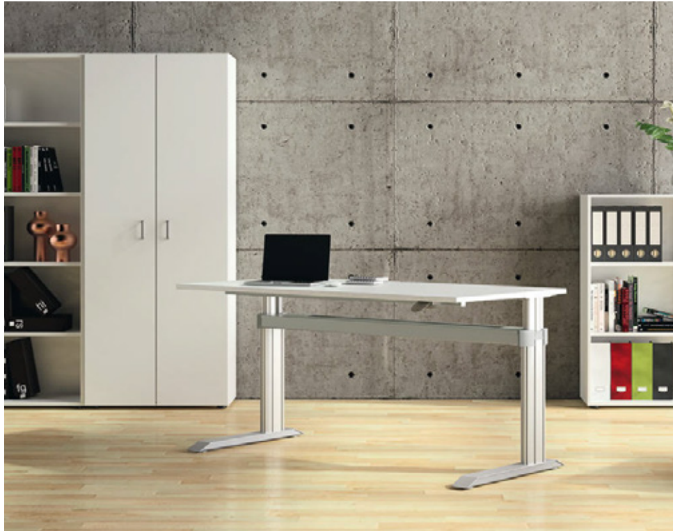
GO 2 Basic Sit-Stand WorkCenter